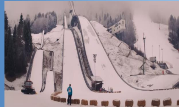
Eddie the Eagle (2016)