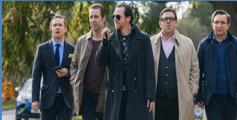
The World's End (2014)