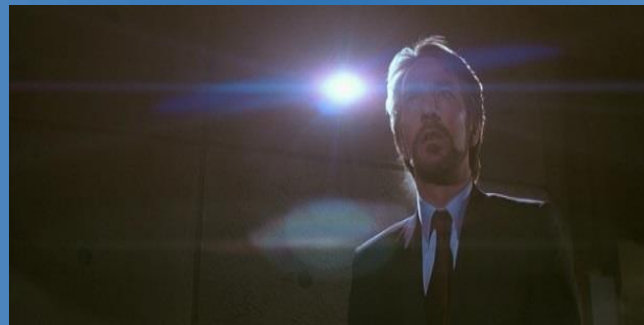
Die Hard (1988)