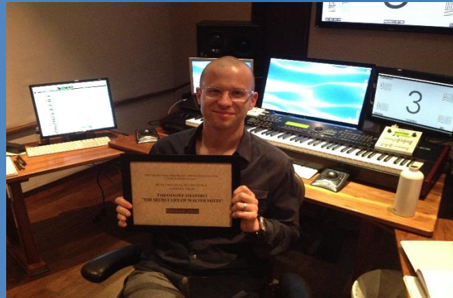
Theodore Shapiro (Spy/Ghostbusters)