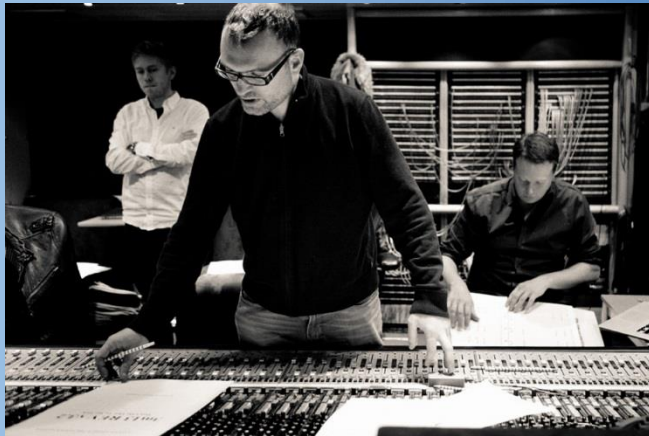
Henry Jackman (X-Men: First Class/Kick-Ass)