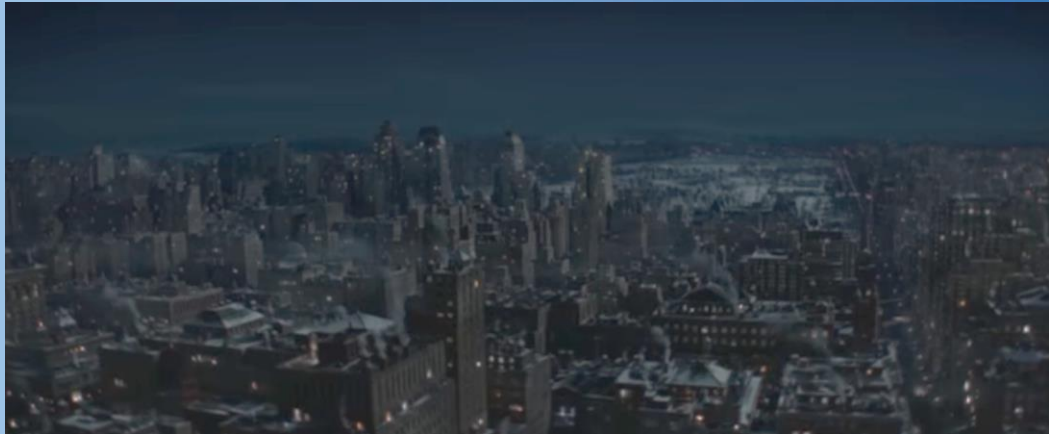
Fantastic Beasts & Where to Find Them (2016)