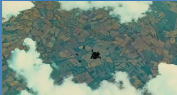
Kingsman: The Secret Service (2015)