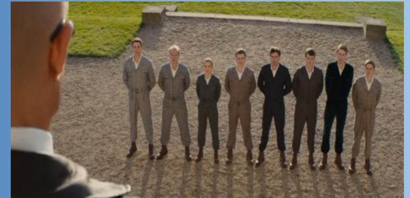
Kingsman: The Secret Service(2015)